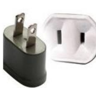
Type A: This socket has no alternative plugs

The electric voltage in the U.S. is 120V. Currently, most appliances are compatible with up to 220V.