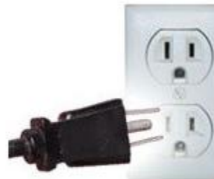
Type B: This socket also works with plug A