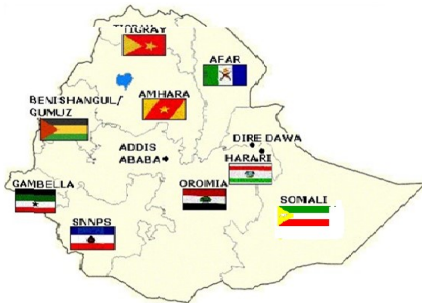
Figure 1. Map of Ethiopia